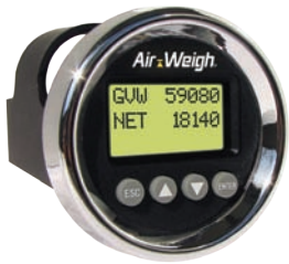
Air-Weigh Straight Truck Scale