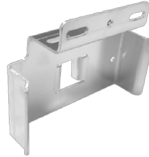
Shielded, Van-type Bracket Part: 010-0062-000